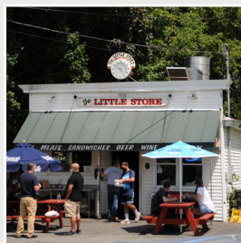
The Little Store Lebanon, NH