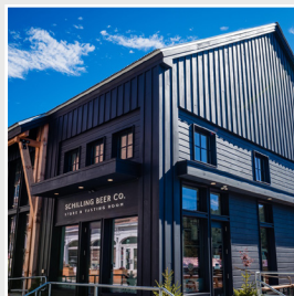
Schilling Beer Co. Littleton, NH

GRDC connects businesses and entrepreneurs from a variety of industries to critical resources and services.