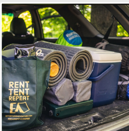
Effortless Adventures Plymouth, NH